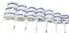
CritterCuffs - small Sizes 2.0 cm-5.5 cm Included with BP Module