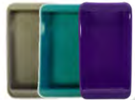
Protective Cover Item #: 9057 Sand, Teal, Purple