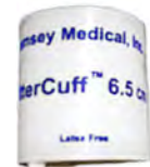
CritterCuffs - large Sizes 5, 6.5, 8, 10, 13 Sold separately