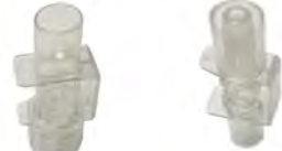
Large Item #: 9034 Small Item #: 9035