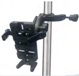
Pole Mount Item #: 9042