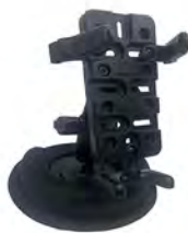
Table Mount Item #: 9045