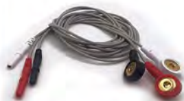
3 Lead Wire Set Item #: 9030