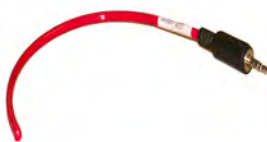
Rectal Temp. Probe Item #: 8041