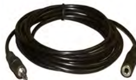
Temp. Ext. Cable Item #: 9014