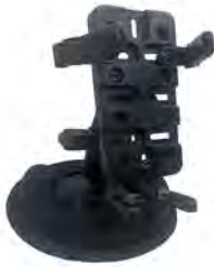
Pole Mount Item #: 9042