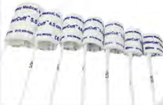
CritterCuffs - small Sizes 2.0 cm-5.5 cm Included with petMAP g3