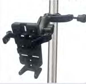
Table Mount Item #: 9045