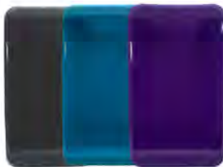
Protective Cover Item #: 9057 Black, Aqua, Purple