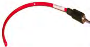
Rectal Temp. Probe Item #: 8041