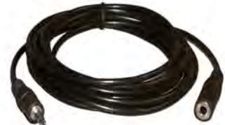
Temp. Ext. Cable Item #: 9014