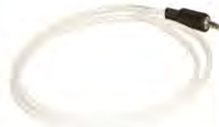
Eso. Temp. Probe Item #: 8040