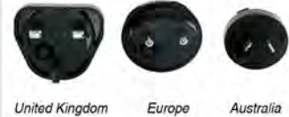
International Adaptor Plugs Item #: 9008