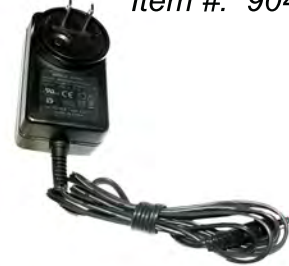
AC/DC Adpater Item #: 9043