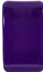
Protective Cover Item #: 9057 Purple