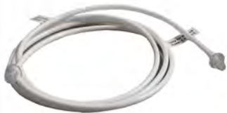
BP Extension Hoses Items #: 9009, 9010 Included with petMAP