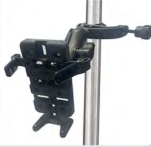
Table Mount Item #: 9045