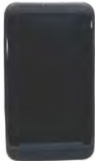
Protective Cover Item #: 9057 Black