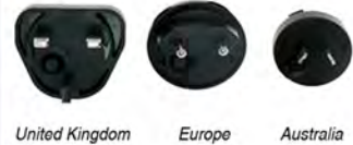
International Adaptor Plugs Item #: 9008