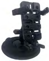
Pole Mount Item #: 9042