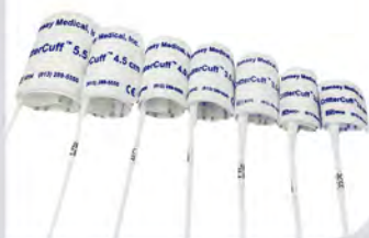
CritterCuffs - small Sizes 2.0 cm-5.5 cm Included with petMAP