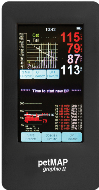
7300 petMAP graphic II

A user interacts with petMAP g II using its touch screen, just like many smart phones. The user can set alarms for systolic blood pressure and can set a BP cycle time for automatic reminders to start another BP measurement.