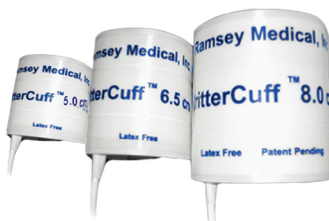
*Sold separately, not included in petMAP gII System