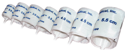
CritterCuffs included with petMAP gII System