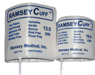
*Sold separately, not included in petMAP gII System