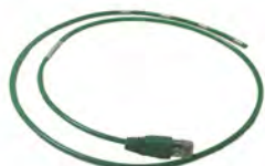
Cat Catheter (ECG & Temp.) Item #: 3205-0001