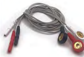
3 Lead Wire Set Item #: 9096