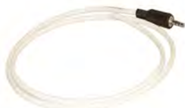
Eso. Temp. Probe Item #: 8040