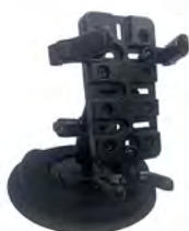
Table Mount Item #: 9045