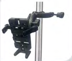
Pole Mount Item #: 9042