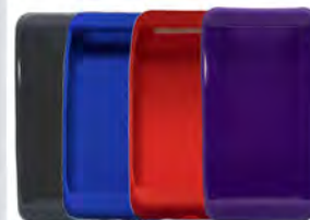
Protective Cover Item #: 9057 Black, Blue, Red, Purple