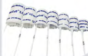
CritterCuffs - small Sizes 2.0 cm-5.5 cm Included with petMAP