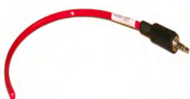
Rectal Temp. Probe Item #: 8041