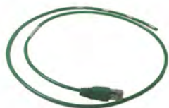
Cat Catheter (ECG & Temp.) Item #: 3205-0001