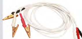
3 Lead Wire Set Item #: 9030