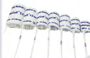
CritterCuffs - small Sizes 2.0 cm-5.5 cm Included with petMAP